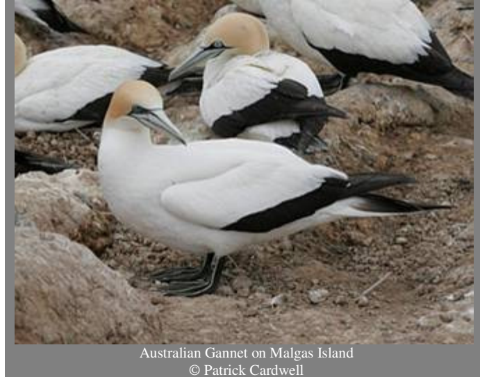
Australian Gannet on Malgas Island