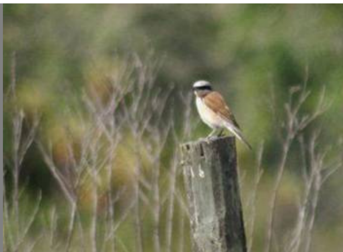
Red-backed Shrike in Wilderness