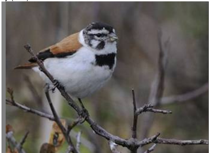
"Damara" Canary in the West Coast National Park

The salt marsh hide at Geelbek in the West Coast National Park also turned up 2 LESSER SAND PLOVERS on Friday (17 th ).