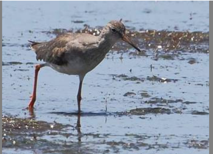
Common Redshank at Geelbek