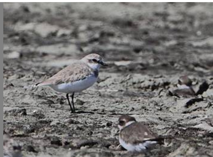
Lesser Sand Plover at Geelbek