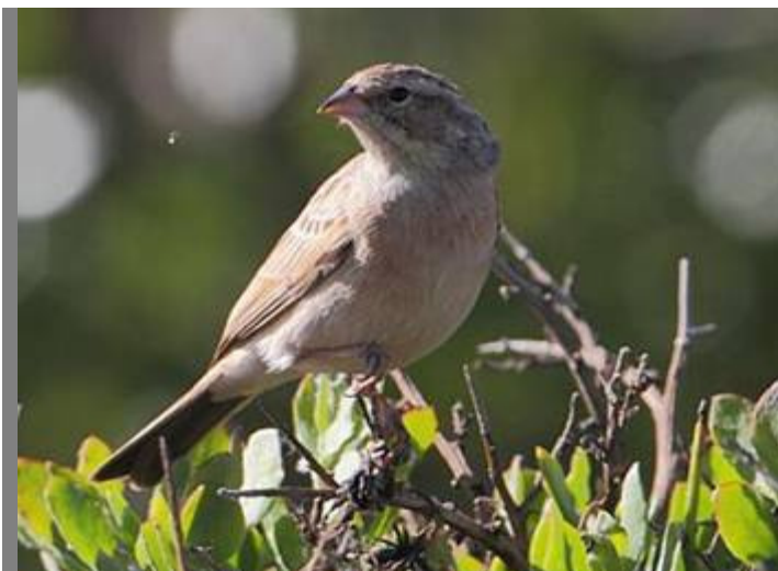
Lark-like Bunting in the West Coast NP

Up on the west coast, the West Coast National Park seemed to be the place to be on the weekend (13 th /14 th ). Along with good numbers of BLACK-HEADED CANARIES (of both forms) at various sites in the park, there also seems to have been a major influx of LARK-LIKE BUNTINGS into the park with birds present at several places yesterday in good numbers. Elsewhere in the park, at least 2 LESSER SAND PLOVERS continued to perform at the old salt marsh hide to the south of Geelbek Manor House throughout the weekend whilst the BLACK TERN was also still on view at Seeberg hide yesterday. Also new to the list of recent west coast rarities was the discovery yesterday of a COMMON REDSHANK at the main Geelbek hide which was feeding just off to the right