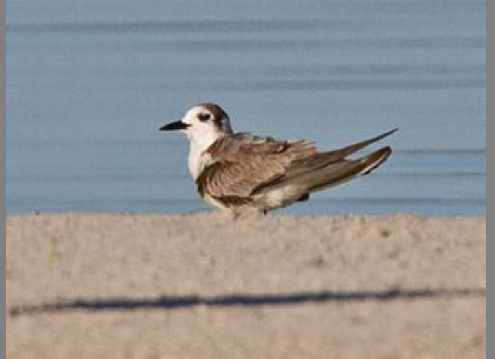
Black Tern at Seeberg