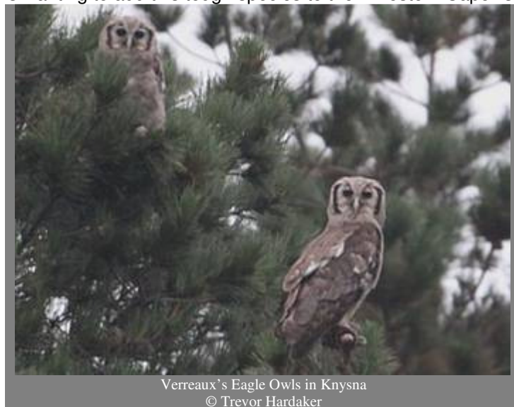
Verreaux's Eagle Owls in Knysna

On the Garden Route, the pair of VERREAUX'S EAGLE OWLS along with their youngster remain reliably on view in the Hunter's Home area of Knysna and were still showing well on the weekend for provincial listers wanting to add this tough species to their Western Cape lists.