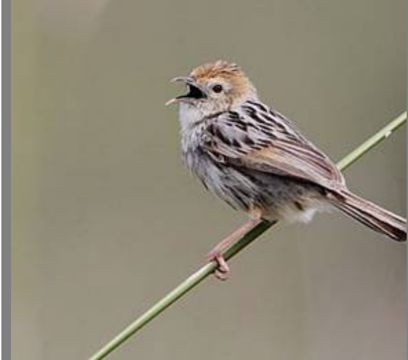
Wailing Cisticola west of George