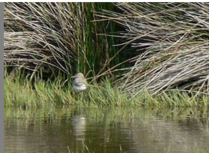
Pectoral Sandpiper at Woodbourne Pan