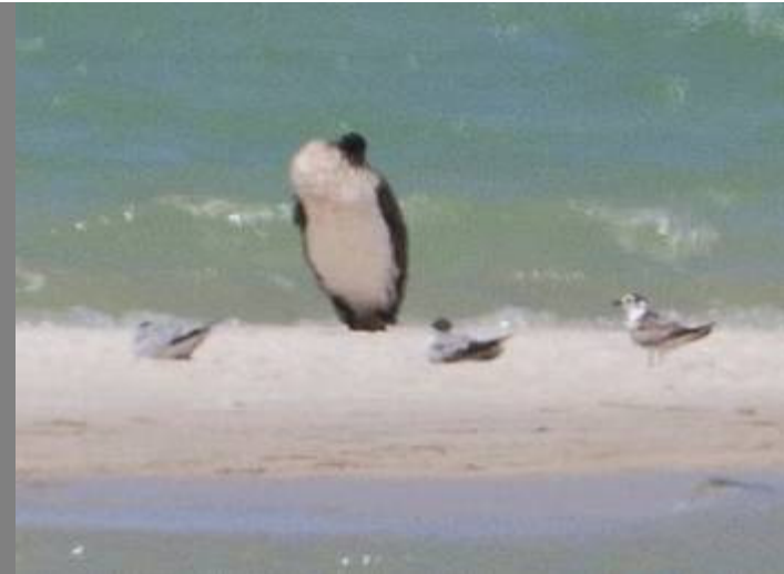
Black Tern (at 100 miles away!) at Seeberg (bird on right)