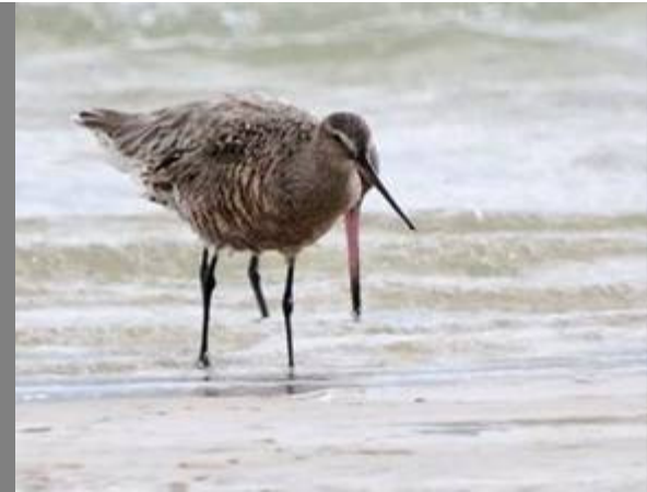
Hudsonian Godwit at Seeberg