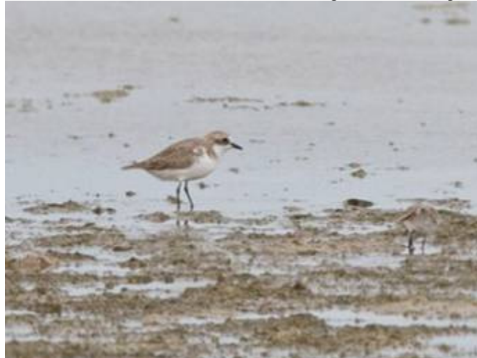
Lesser Sand Plover at Geelbek

Moving up on to the west coast, BLACK-HEADED CANARIES are still regularly being reported with recent sightings from the Darling district as well as at several different sites in the West Coast National Park. In the West Coast National Park, the recent news of the LESSER SAND PLOVERS at Geelbek has also attracted some attention with the birds still present earlier today. Latest information shows that there are at least 2 individuals in non-breeding (winter) plumage which means that there is a minimum of 3 birds present there. Just to clarify, these birds are not seen at any of the two newer hides there that you reach via boardwalks, but are visible from the old semi-sunken hide (the first one that you reach) at the salt marsh which lies to the south of the Geelbek Manor House and is reached via a 1km walk through the veld to get there.