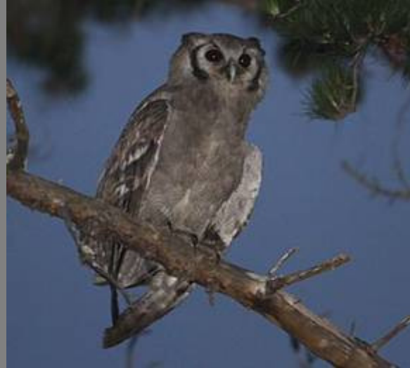
Verreaux's Eagle Owl in Knysna