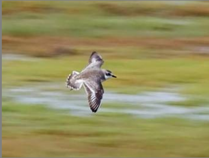
Lesser Sand Plover at Geelbek