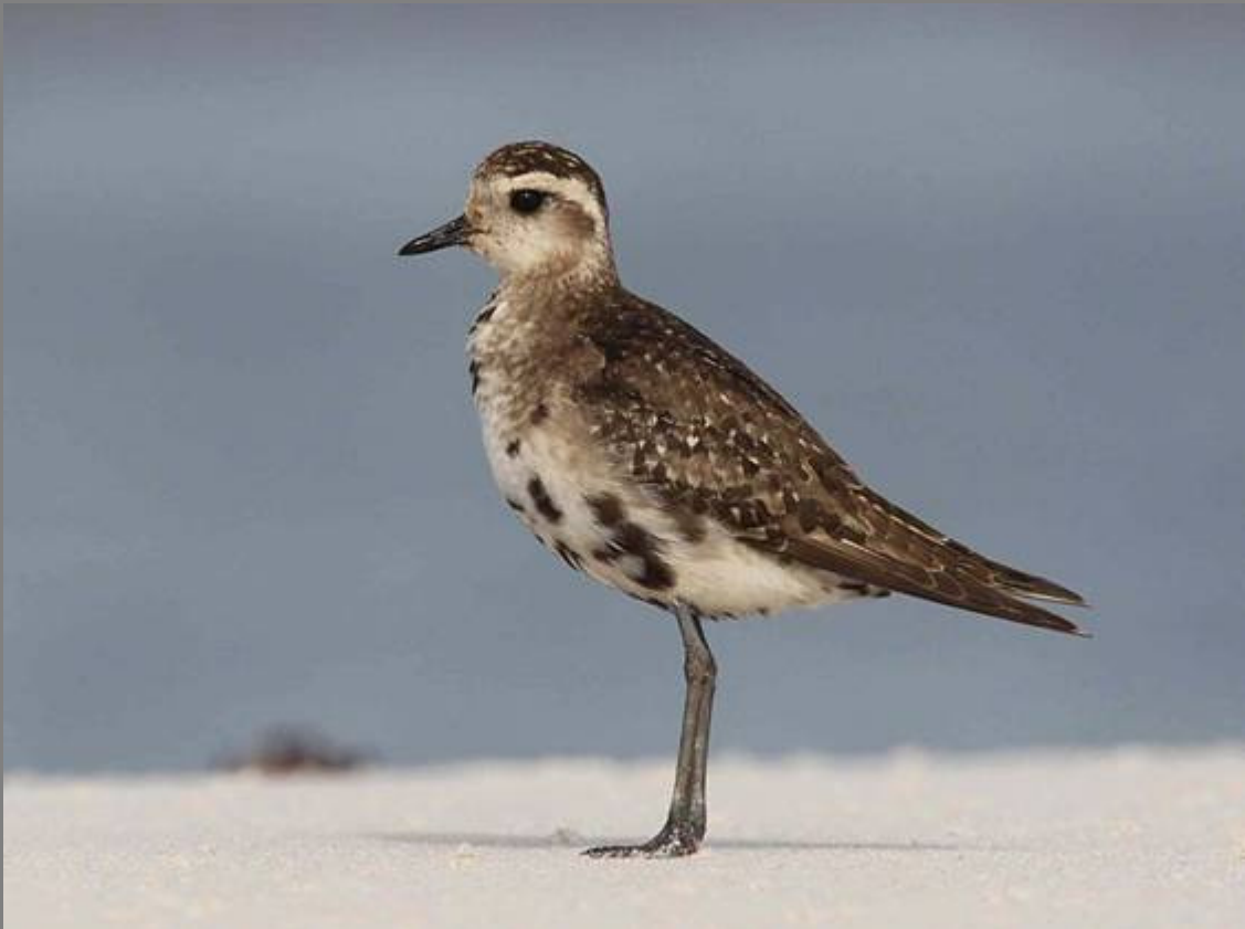
American Golden Plover near Olifantsbos

Limpopo Province has not missed out on the action either producing a PACIFIC GOLDEN PLOVER at the Den Staat Wetlands near Mapungubwe National Park earlier today with a YELLOW WAGTAIL as supporting cast.