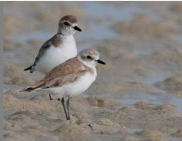
Lesser Sand Plovers at Seeberg