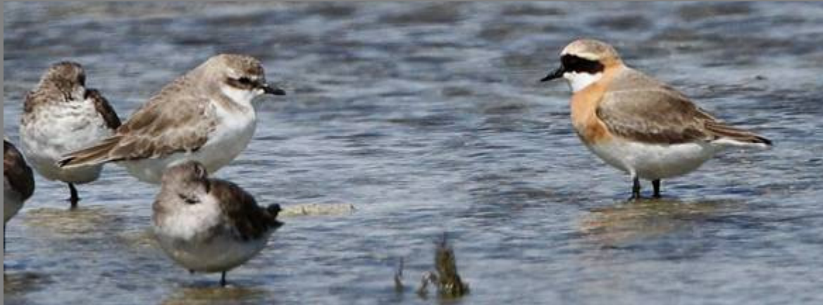
Lesser Sand Plovers at Geelbek salt marsh hide Non-breeding plumaged bird on left and breeding plumaged bird on right

Barrie Rose has just called in to report that there were 2 LESSER SAND PLOVERS (aka Mongolian Plovers) at the Salt Marsh hide just south of the Geelbek Manor House in the West Coast National Park late this afternoon. One of the birds is in non-breeding (winter) plumage whilst the second individual is still in breeding (summer) plumage. These birds do turn up in this area from time to time, but there are still a number of locals who need this species for their provincial lists (or even their life lists).