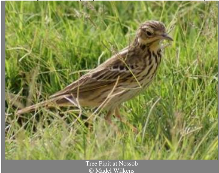
Tree Pipit at Nossob

In the Northern Cape, there was some excitement late last week when a TREE PIPIT was discovered walking around in one of the staff gardens in Nossob in the Kgalagadi Transfrontier Park. This is way out of range and surely represents the first record for the province.